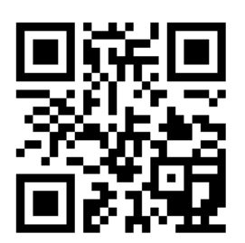
Anonymous Bully Report Form